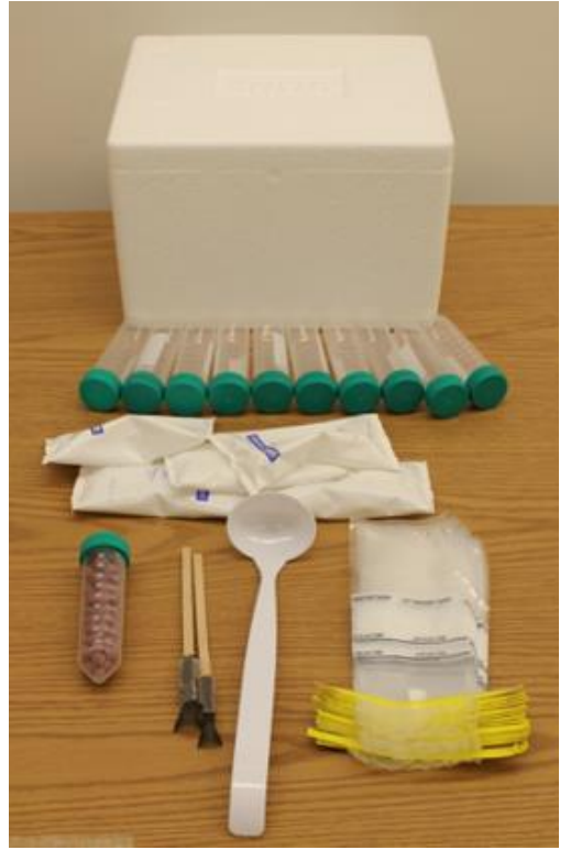
Materials included in the kit