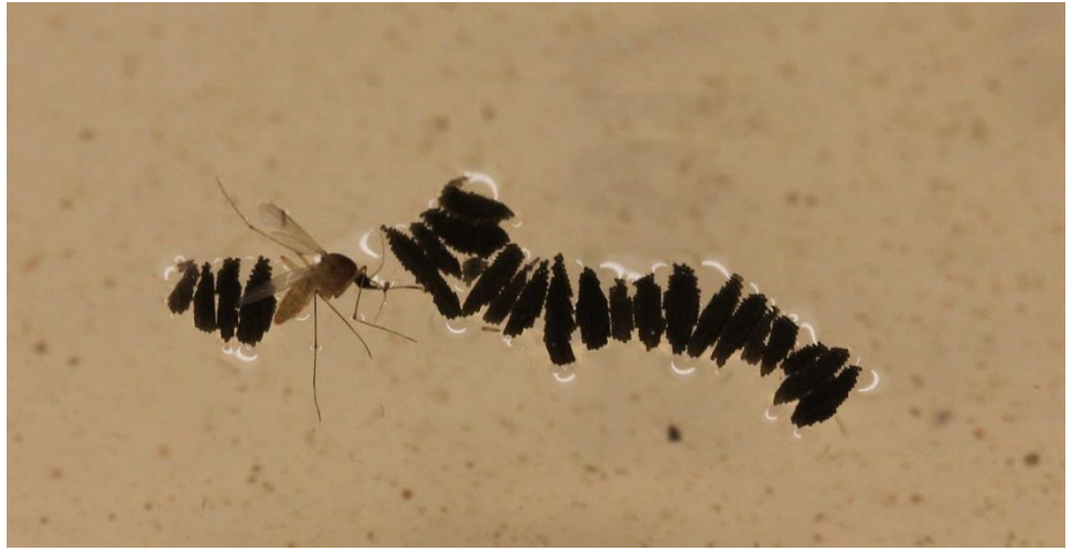
Egg rafts with adult Cx. pipiens for scale

1) Wait to sample until July – September to increase your probability of obtaining Cx. pipiens egg rafts. Earlier times may be suitable along the southern border of our region.